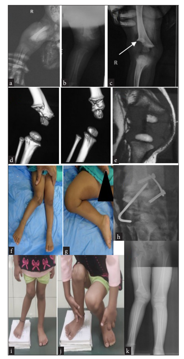
Figure 2 : Illustrative case 1: (a) Anteroposterior view of right knee joint at age 10 days when septic arthritis of the joint was diagnosed. (b). Partial loss of epiphysis visible by 6 months. (c) Typical unicondylar loss of distal femur and adjacent metaphysis on lateral side at 12 months. Metaphyseial spur could also be appreciated (white arrow). (d) Computed tomography (e) MRI images of the lesion. (f,g) Clinical deformity and knee range of movement at 1.5 years. (h) Combined procedure distal medial closing wedge femoral osteotomy and tension band plating of medial side. (i,j,k) Follow- up 31 months – clinical and radiological findings of recurrent deformity.

A 2.5-year-old girl was seen with severe valgus deformity of the right knee region [Figure 3]. The parents reported the