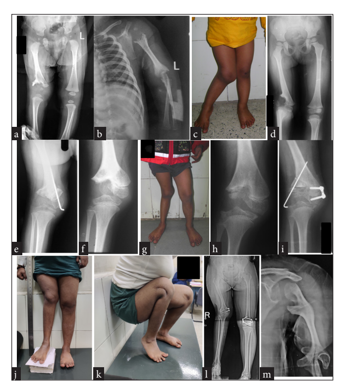
Figure 3 : Illustrative case 2: (a,b) severe neonatal sepsis with multifocal joint involvement. Radiographs at 2 months. Lesions are obvious in the right knee and lateral metaphysis, left shoulder, and elbow region. (c,d) Child at 2.5 years of age. Clinical deformity and radiological appearance. (e,f) Medial closing wedge osteotomy of the distal femur was performed at age 3 years. Healed osteotomy and corrected limb alignment at this stage. (g,h,i) Child at 6 years. The deformity had recurred. Partial regeneration of the lateral condyle is obvious. There was evidence of an eccentric physeal bar in the distal femur which was excised and a medial side tension band plating was added. (j,k) Follow up at skeletal maturity at age 14 years. Residual valgus at knee and limb length discrepancy. Knee range of movements fairly preserved. (l,m) Scanogram of the limb and the fate of other affected joints at the same follow-up.

intravenous antibiotics. The loss of the right lateral femoral condyle was obvious as early as 2 months in this child. At the time of presentation to our institution, the LDFA was 56.4 degrees. At age 3 years, the child underwent a distal medial closing wedge femoral osteotomy. Deformity at this time was 80 degrees. At 6 years, with the onset of recurrent deformity, an eccentric physeal bar was detected. The bar was excised and growth modulation of the medial femoral side was added. The limb length discrepancy at this time had progressed to 5 cm and therefore, concomitant left distal femoral complete epiphysiodesis was also performed. At the last follow-up, when the child had achieved skeletal maturity (at age 14 years), the right knee movements were relatively preserved, but there was a residual valgus of 12.4 degrees. The limb length discrepancy was 4 cm at this time. The patient is being planned for deformity correction and limb length equalization surgery.